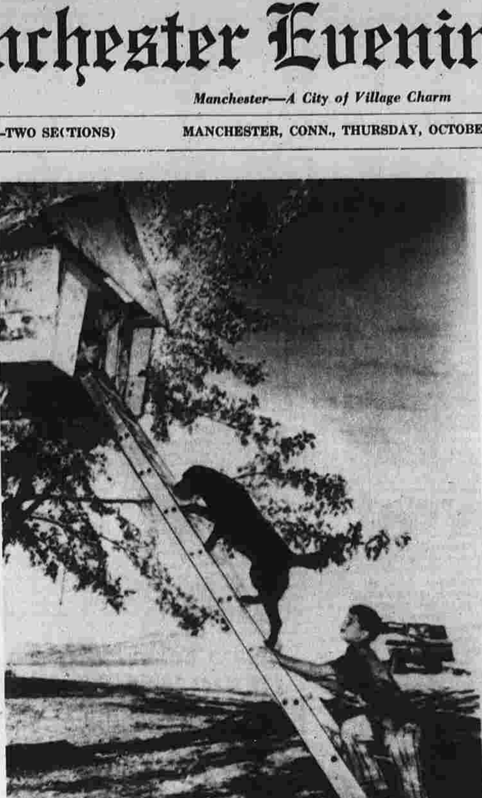
Password to Club Spook, a Labrador retriever from Helena, Mont., wasn't to be left out of the neighborhood treehouse gang, so he mastered the ladder.